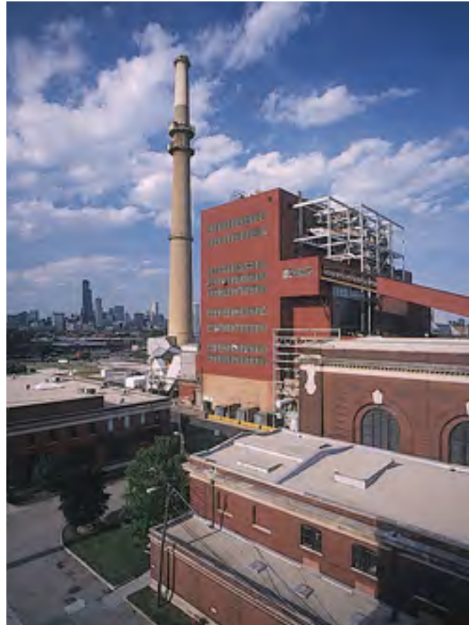
Fisk Generating Station, located in Chicago's Pilsen neighborhood, produces up to 326 megawatts of electricity.