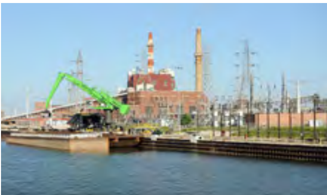
Crawford Generating Station, located in Chicago's Little Village neighborhood, produces up to 542 megawatts of electricity.