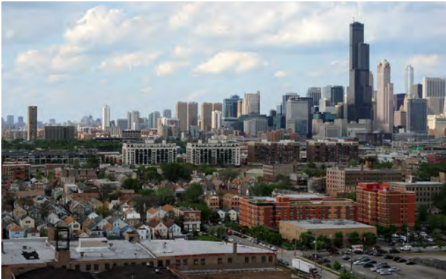
Midwest Generation operations in Chicago provide economic benefits to the city and essential power to the electric grid.